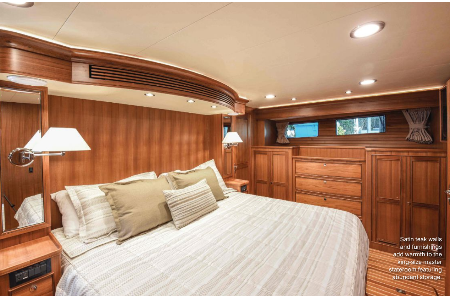
Satin teak walls and furnishings add warmth to the king-size master stateroom featuring abundant storage.

THANKS TO THE SMART HULL DESIGN, TWIN VELOCIJET STRUT KEELS, AND NAIAD FIN STABILIZERS, THE 62E REMAINED ESSENTIALLY FLAT AS JEFF TIGHTENED THE TURNS, THEN RAN THROUGH THE BOAT’S OWN WAKES. EVEN IN 5-FOOTERS, JEFF EXCLAIMED, “SHE’S STABLE AS HELL!”